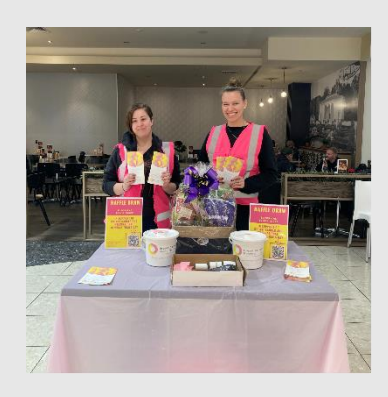
Annual Appeal Chartwell Shopping Centre

A touch of pink makes all the difference in raising awareness and FUNds for breast cancer. We share some of the highlights of how 2023 was PINKAFIED