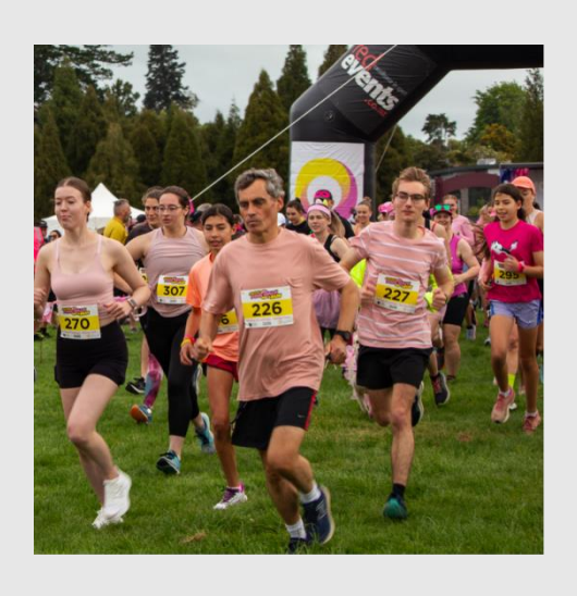
Pink Walk & Run Hamilton