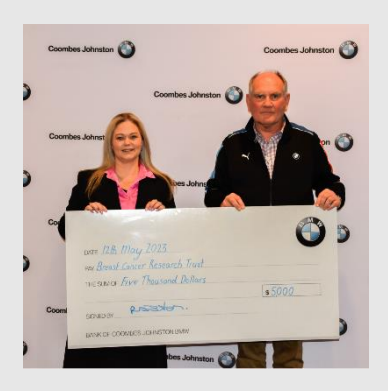
Coombes Johnston BMW Golf Day